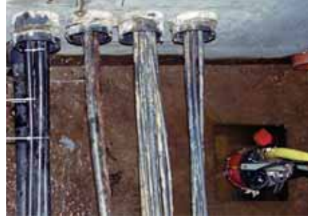
Eliminates the need to pump manholes dry, avoids ingress of mud into ducts, and withstands severely polluted environments.