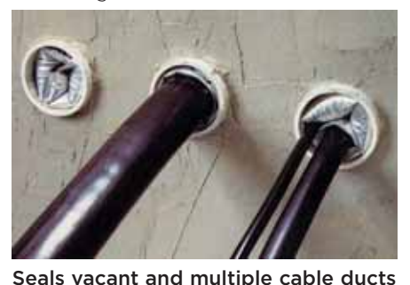
Depending on the duct diameter, most Rayflate bags seal vacant ducts and ducts which contain up to two cables. Sealing of three or more cables can be easily achieved by merely inserting a mastic sealant-clip between the

The entire installation is performed within a few minutes – even in congested enclosures – without any messy or installer-sensitive mixing and filling.